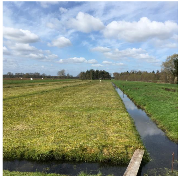
Sphagnum cultivation trials in Germany.

Works will commence in the New Year with completion of the trial beds in spring 2018.