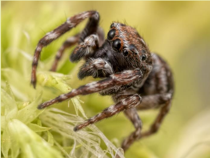
Jumping spider species Sitticus caricis.

Spiders are not everyone's favourite creatures, but did you know that some really rare spiders live in wet bog habitats? The Marches Mosses BogLIFE project has been discovering some of the rarer species that now thrive on their sites.