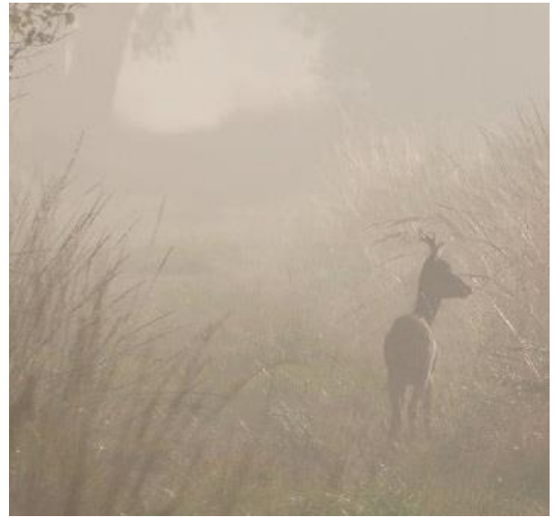
Roe deer Buck.