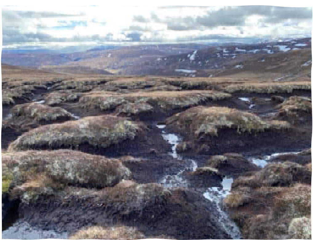
There are expanses of complex erosion with no machine access, at high elevations – most of this work sits at 600-900m asl