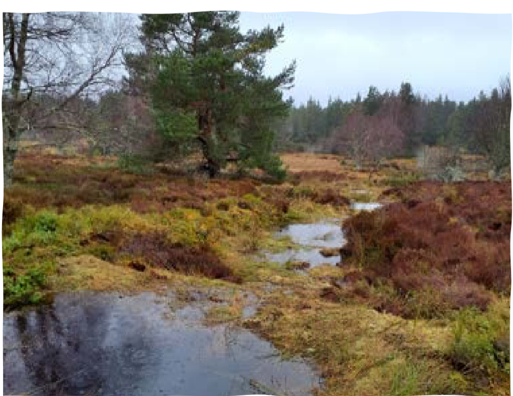
Projects include bog woodland restoration