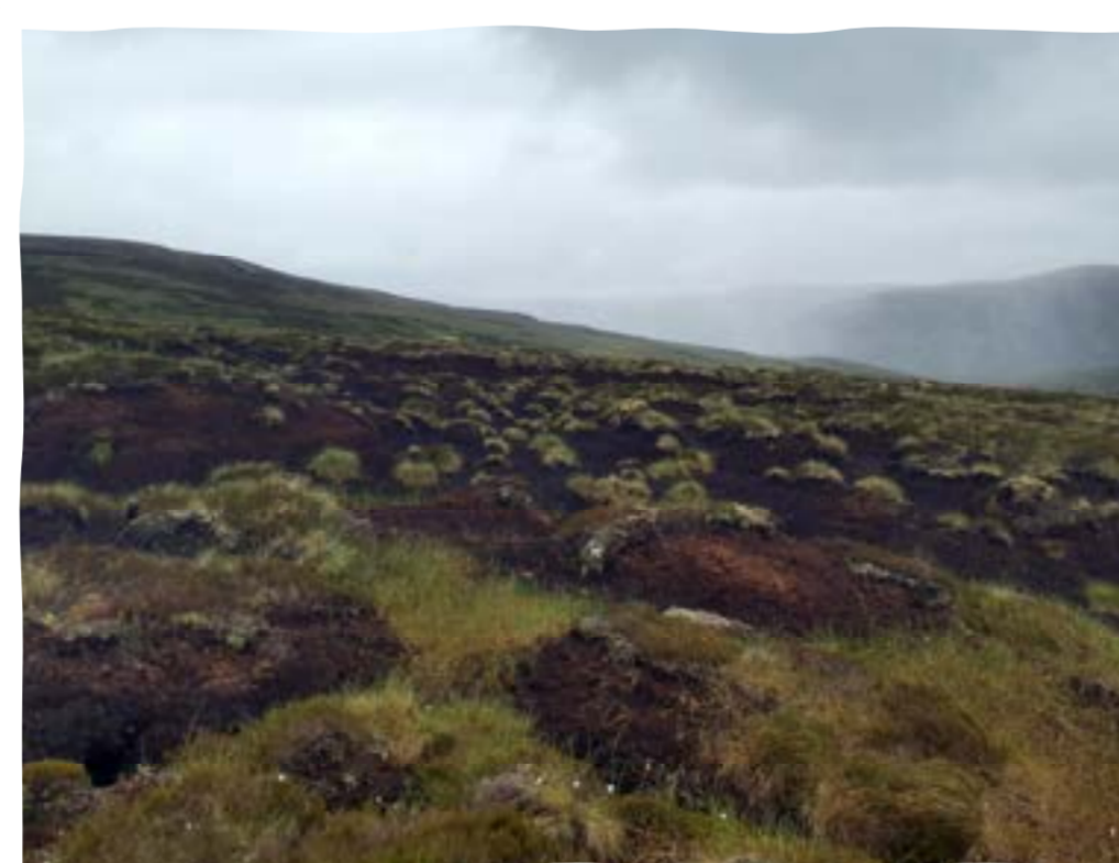
Sites frequently have challenging bare peat with poor turf availability