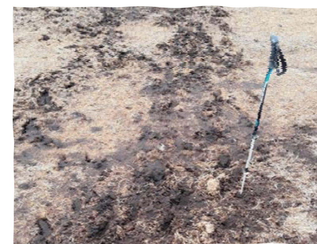
Herbivore impacts may limit choices for restoration techniques in places