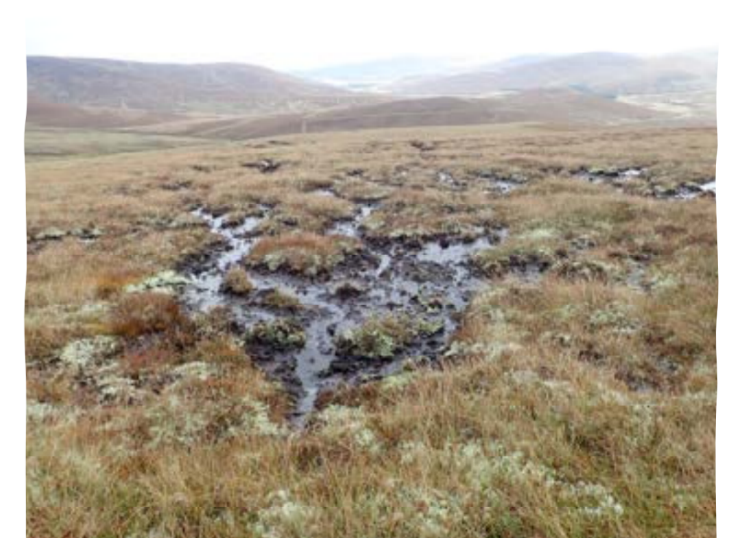
Overburning on grouse moors has left a legacy of poor turf condition to work with