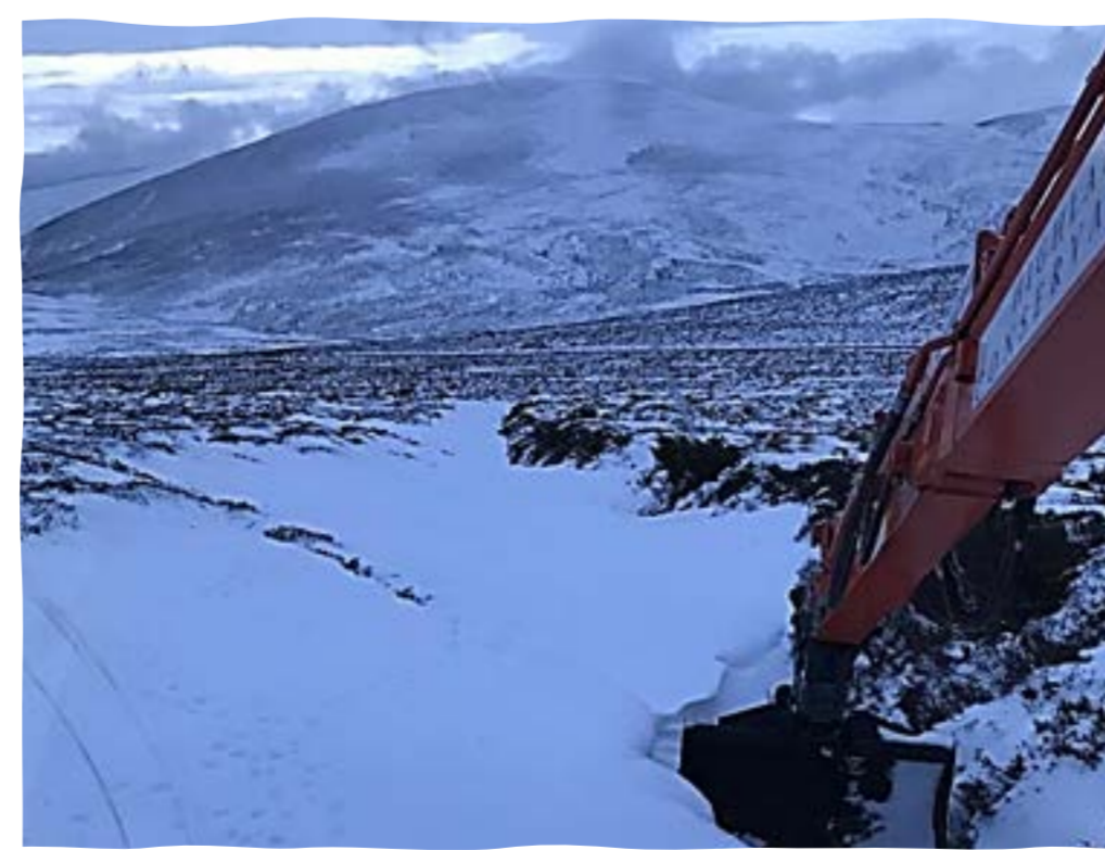
Severe winter weather can span from October to March in the Cairngorms