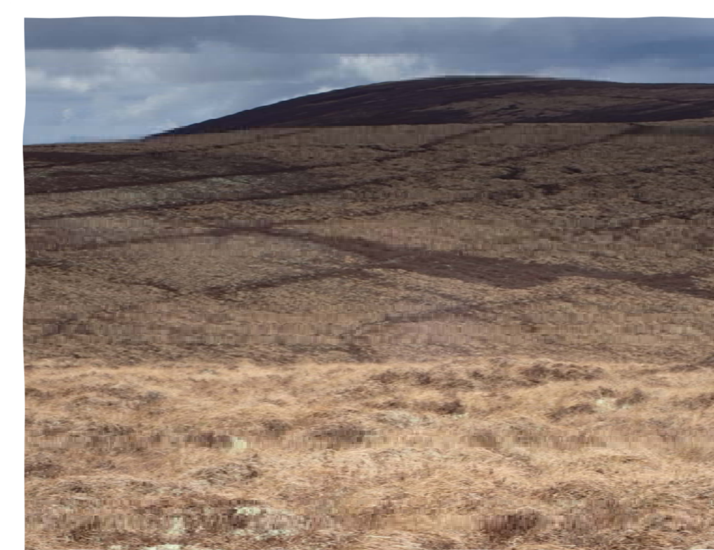
The National Park has large expanses of drained peatland with variable peat depths